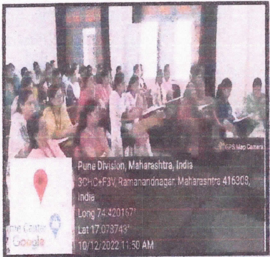
Students and staff attending workshop